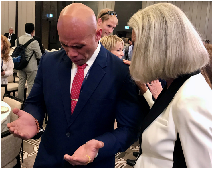
Praying for a Samoan American soldier in Jerusalem.