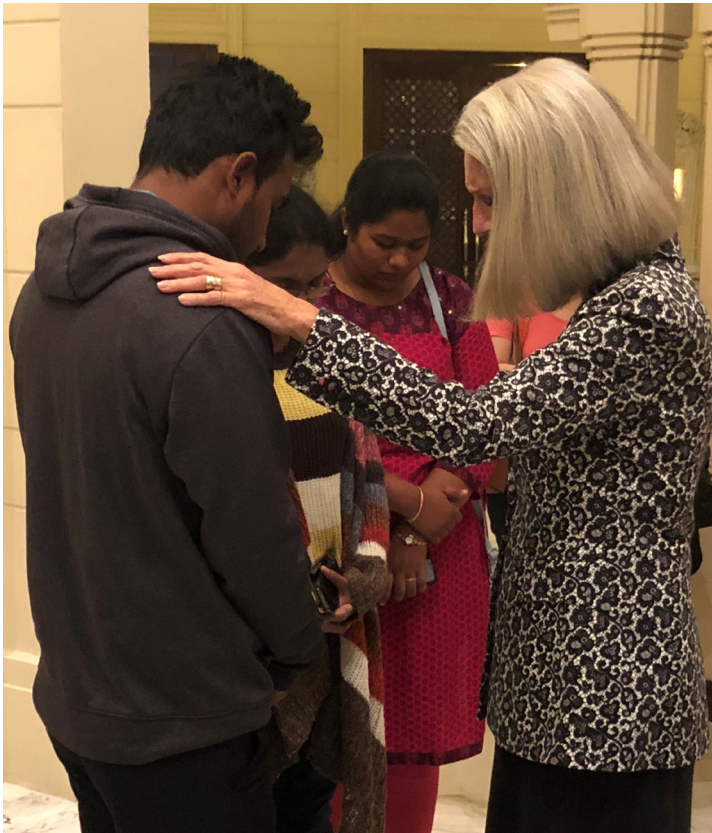
Praying for hotel workers in Hyderabad, India.

Would you keep on praying until the "rain" of God's blessing falls in a great spiritual awakening, or, until Jesus comes...?