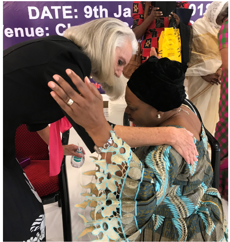
Praying for an African ambassador in India.