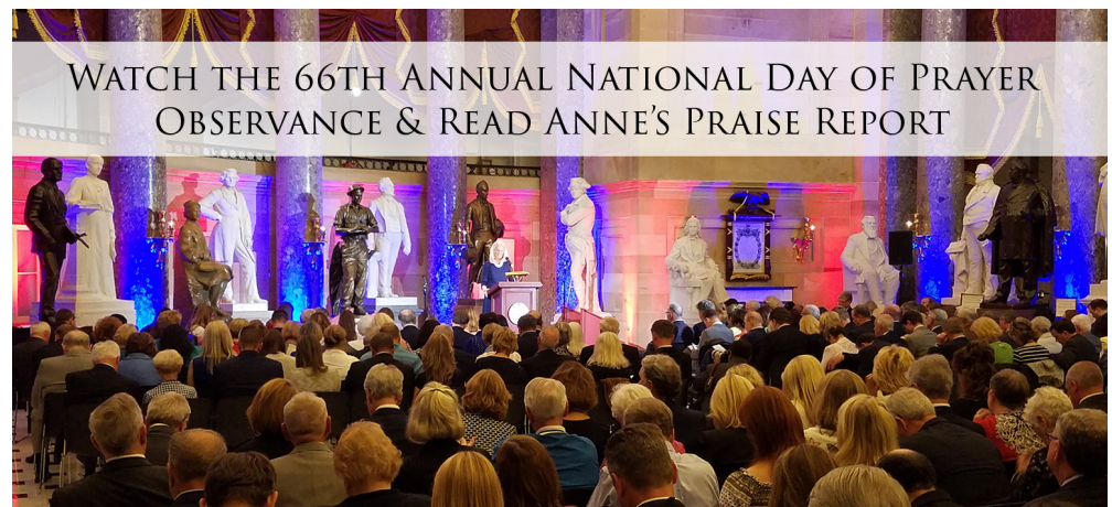
WATCH THE 66TH ANNUAL NATIONAL DAY OF PRAYER OBSERVANCE & READ ANNE'S PRAISE REPORT